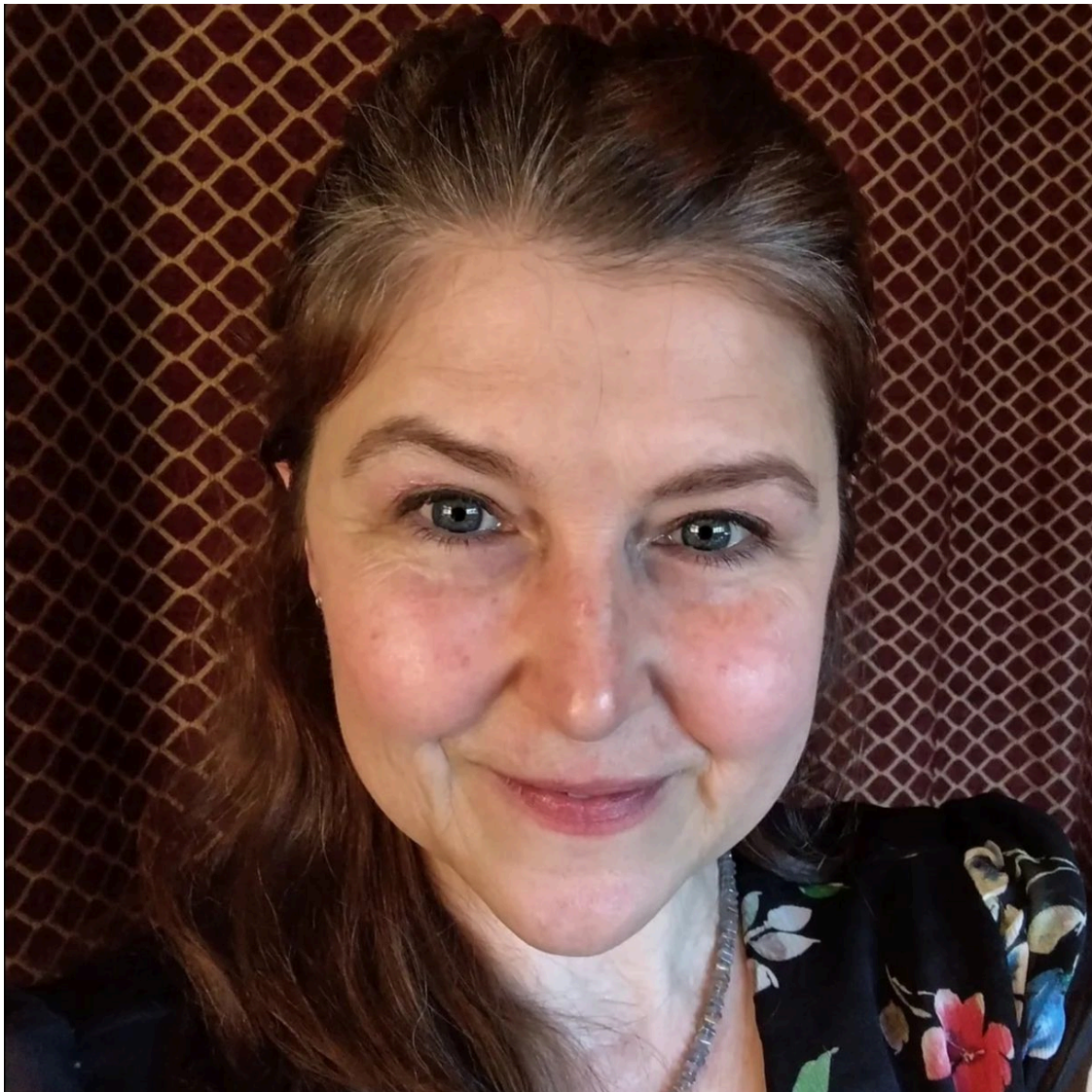
Meet Our Membership Guru